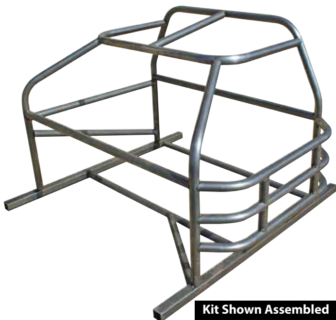
Kit Shown Assembled