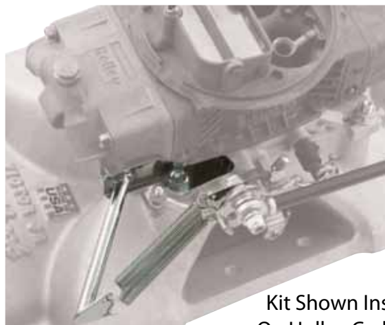
Kit Shown Installed On Holley Carburetor