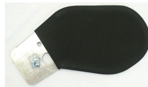
02200 – Left Leg Restraint = $55.00 (with cover)