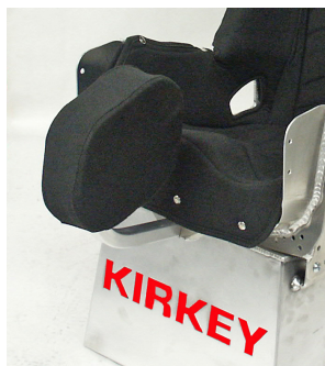
99700 Leg Separator = $128.95(with cover)