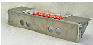
99209 Rear Mount = $69.95