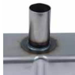
Fully Welded Breather Tubes