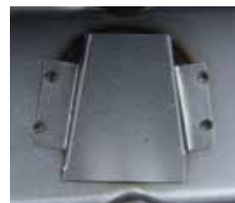
Baffled Breather Tubes